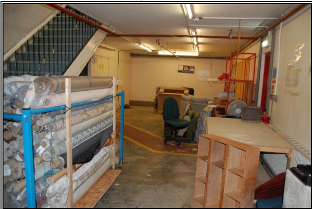
Ground Floor Workshop