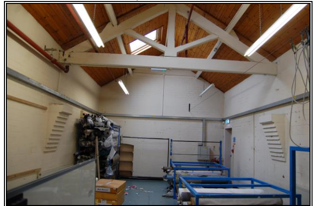
First Floor Workshop